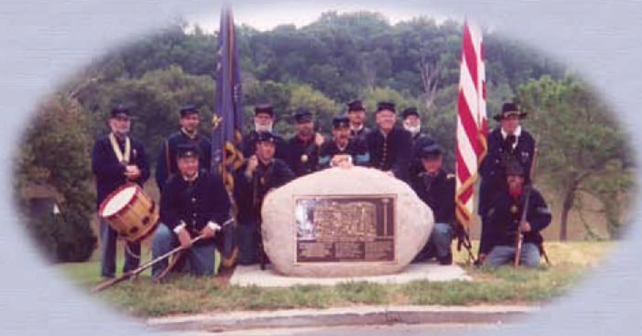
Monument Dedication August 31, 2003, Fredricksburg, Virginia